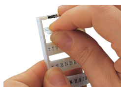
Separating a strip from the WMB or WMB marker card.