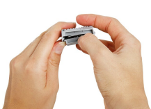
Open the Gelbox at the side latches.