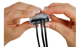
Close latch securely.