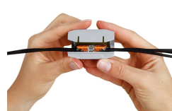
Close the Gelbox.