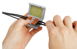
Place the wired connector in the Gelbox.