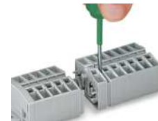
Removing a terminal block.