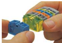
Assembling modular terminal blocks into terminal strips.