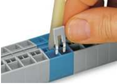
Commoning with comb-style jumper bar.