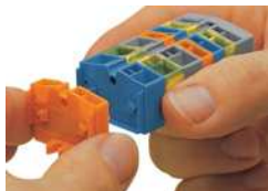
Mounting an "end terminal block" with mounting flange.