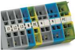
Marking via Mini-WSB Quick Marking System.