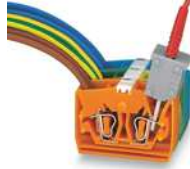
Testing via CAGE CLAMP® on the current bar (max. nominal current: 6 A). CAGE CLAMP® clamps individual test contacts. The maximum test voltage is 400 V.