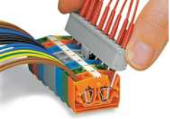
Testing by touch contact to the CAGE CLAMP® spring (limited to 0.5 A and 48 V test voltage) – test pins are not protected against accidental contact.