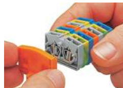
Mounting an end plate.