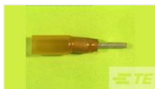
TE Part #695463-000 B-801-36