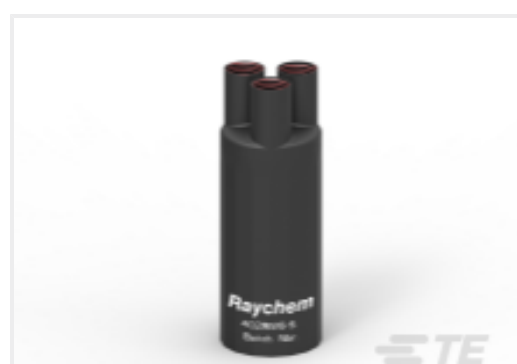
TE Part #CAT-CABLE-BREAKOUT Heat Shrink Halogen-Free Cable Breakout Boots