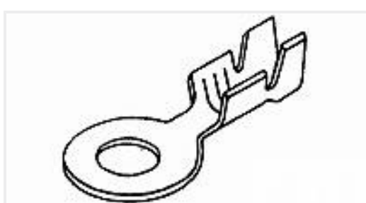
TE Part #42864-2 RING CRIMP 12-10 AWG TPBR