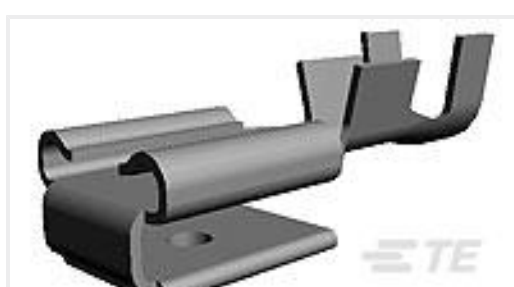
TE Part #60279-2 250 FASTON REC 18-14 AWG TPBR