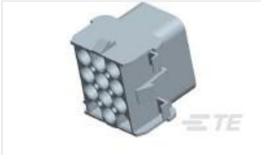
TE Part #1-1863006-2 UMNL 12 WAY CAP HOUSING