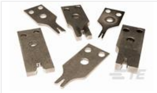
TE Part #4-456406-1 CRIMPER, WIRE .090