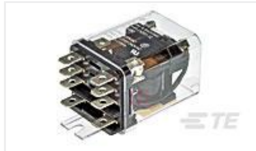
TE Part #7-1393114-0 KUHP-11A51-24=KU-