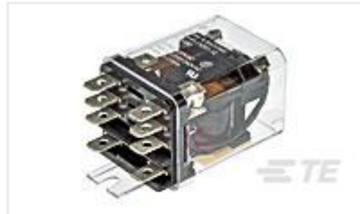
TE Part #7-1393114-1 KUHP-11A51-240=KU