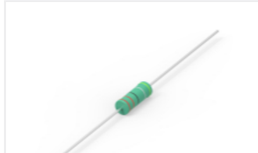
TE Part #6-2176610-1 EP 1W (SS) 330R 5%