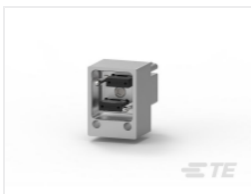
TE Part #2828383-1 CONN KIT, VITA66.4-DERIV, RCPT, DUAL-CAVITY