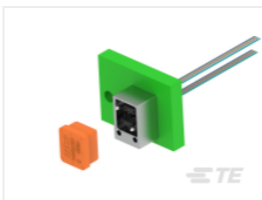
TE Part #2356183-1 Conn Kit, VITA66.4-Deriv, Rcpt, Dual- Cavity