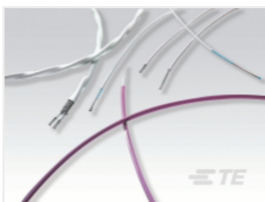
TE Part #CAT-NEMA-M27500-SR NEMA WC27500: Crosslinked ETFE Lightweight Cables