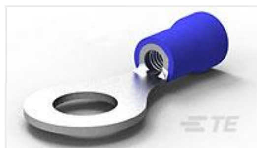
TE Part #130126 PG RING