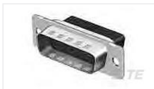
TE Part #205204-4 CRIMP SNAP PLUG ASSY, SIZE 1