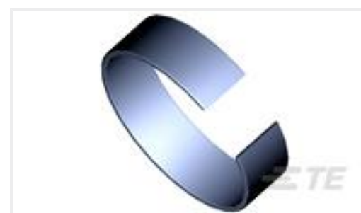
TE Part #745508-2 FERRULE SPLIT RING, HD