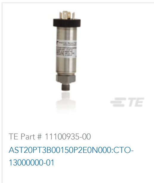
TE Part # 11100935-00 AST20PT3B00150P2E0N000:CTO- 13000000-01