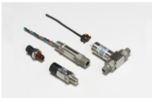
Industrial Pressure Transducers(19)