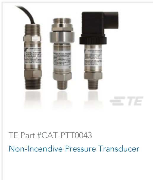
TE Part #CAT-PTT0043 Non-Incandive Pressure Transducer