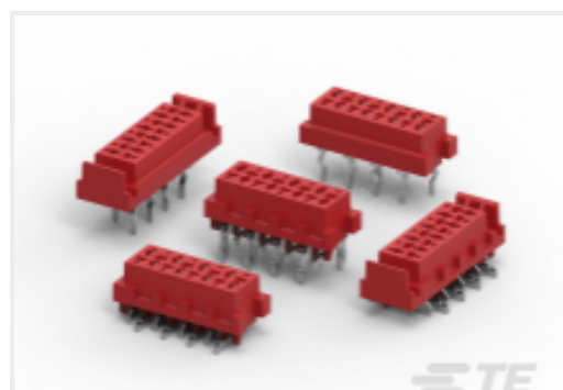
TE Part #CAT-M5833-F3492A Female-on-Board Connector, Top Entry