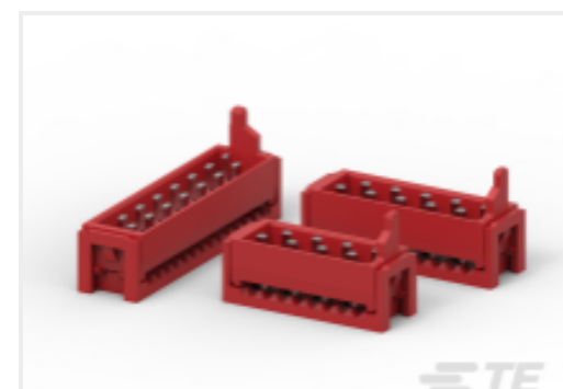
TE Part #CAT-M5833-M2934A Male-on-Wire Connector, Micro-MaTch