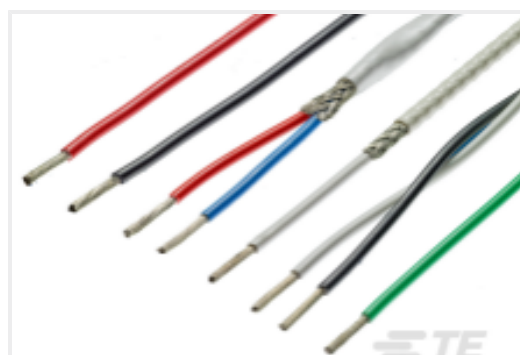
TE Part #3827113001 44A1121-20-2/9-9