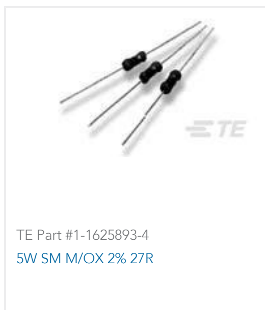
TE Part #1-1625893-4 5W SM M/OX 2% 27R