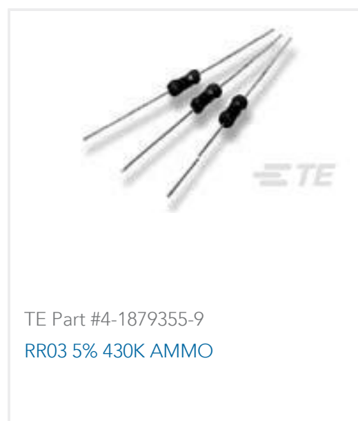
TE Part #4-1879355-9 RR03 5% 430K AMMO