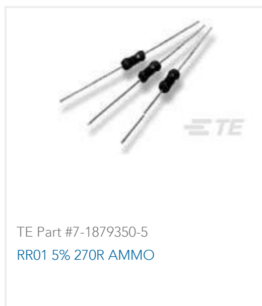
TE Part #7-1879350-5 RR01 5% 270R AMMO