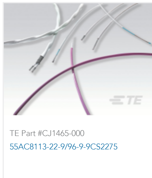
TE Part #CJ1465-000 55AC8113-22-9/96-9-9CS2275