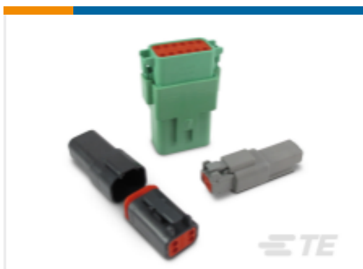
TE Part #DT04-2P DEUTSCH DT Series Housings & Connectors