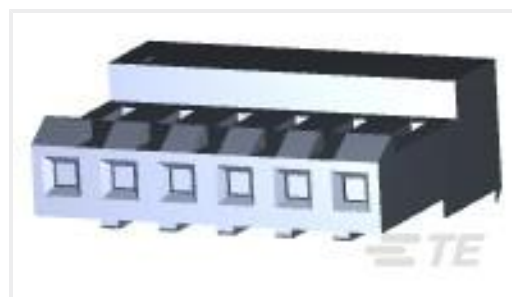
TE Part #3-640426-6 06P MTA156 CONN ASSY 18AWG ORA