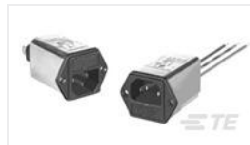
TE Part #1-1609117-6 6EHG8-2=F8291