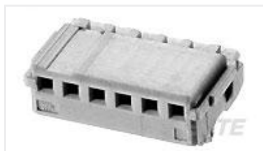
TE Part #353908-2 CT REC HSG 2P CRIMP TYPE WHITE