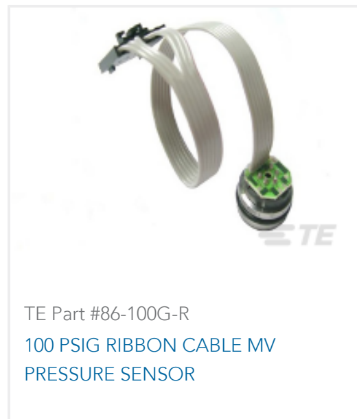
TE Part #86-100G-R 100 PSIG RIBBON CABLE MV PRESSURE SENSOR