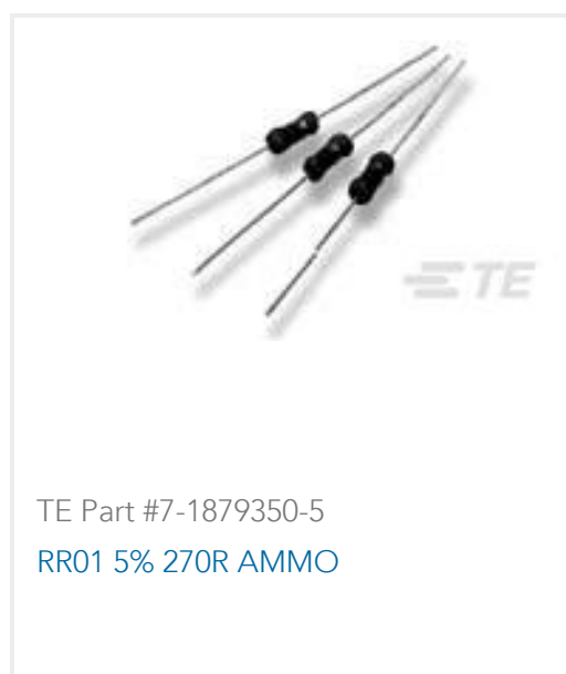
TE Part #7-1879350-5 RR01 5% 270R AMMO