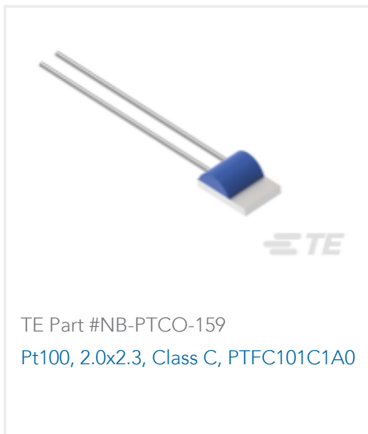
TE Part #NB-PTCO-159 Pt100, 2.0x2.3, Class C, PTFC101C1A0