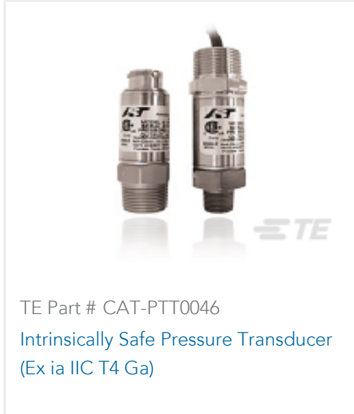
TE Part # CAT-PTT0046 Intrinsically Safe Pressure Transducer (Ex ia IIC T4 Ga)