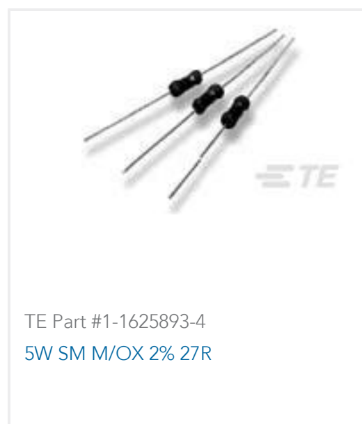
TE Part #1-1625893-4 5W SM M/OX 2% 27R