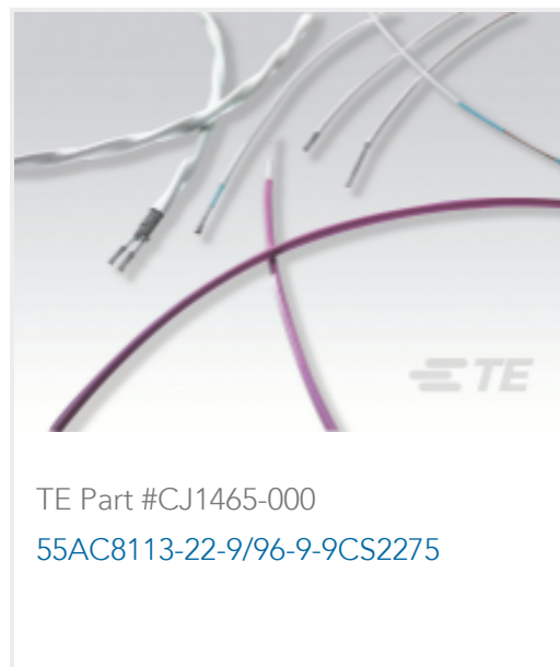
TE Part #CJ1465-000 55AC8113-22-9/96-9-9CS2275