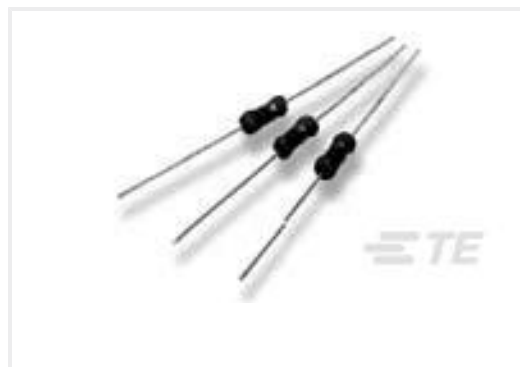
TE Part #1-1625893-4 5W SM M/OX 2% 27R