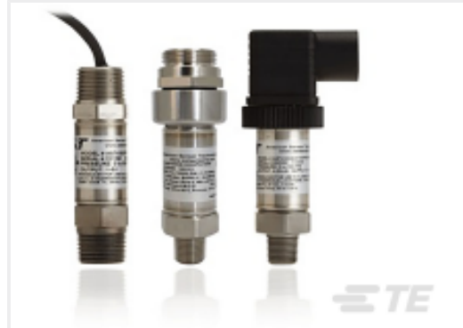
TE Part # 11105668-00 AST4300A00050P4P4000:CTO-13000000-03