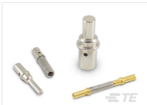
TE Part #CAT-D48-ST273 DEUTSCH Connector Solid Contacts