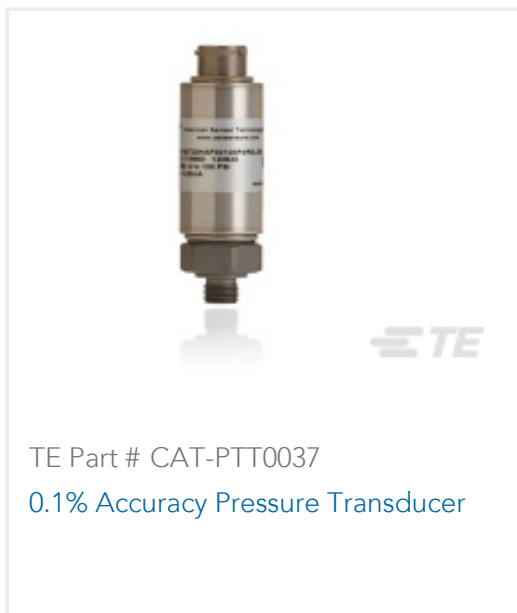
TE Part # CAT-PTT0037 0.1% Accuracy Pressure Transducer