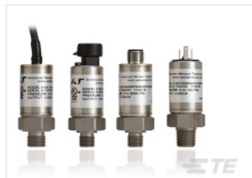
TE Part #11104267-00 AST4000F05000P4D0000:CTO-13000000-02