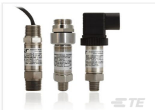
TE Part #CAT-PTT0043 Non-Incendive Pressure Transducer