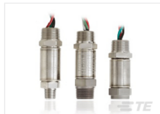
TE Part #11108663-00 300 PSI, 1/4MNPT, 4-20mA, Conduit, 18AWG