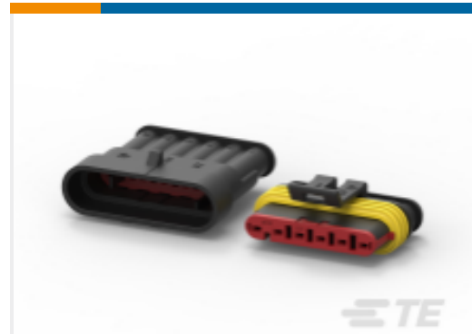
TE Part #282080-1 AMP SUPERSEAL 1.5MM, CONNECTOR HOUSING