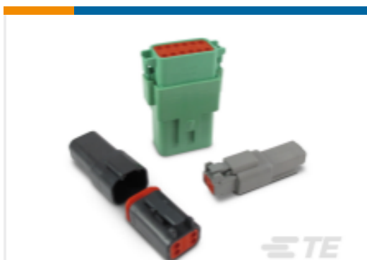
TE Part #DT04-2P DEUTSCH DT Series Housings & Connectors