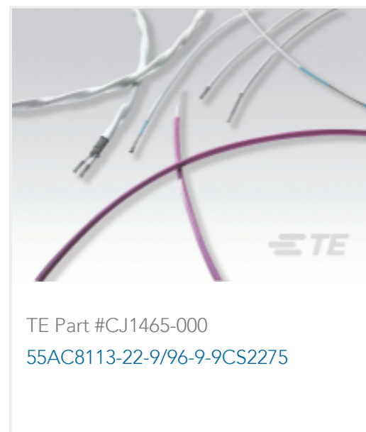
TE Part #CJ1465-000 55AC8113-22-9/96-9-9CS2275