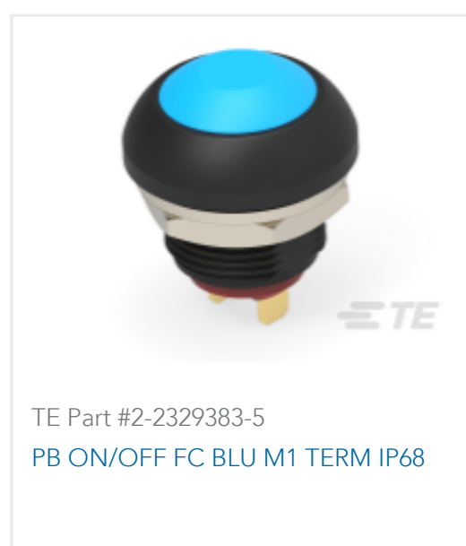
TE Part #2-2329383-5 PB ON/OFF FC BLU M1 TERM IP68