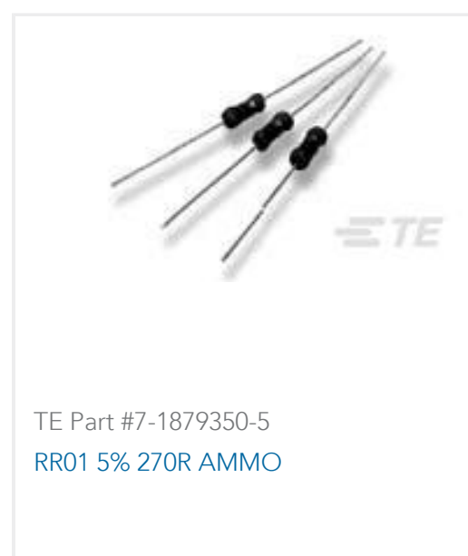
TE Part #7-1879350-5 RR01 5% 270R AMMO