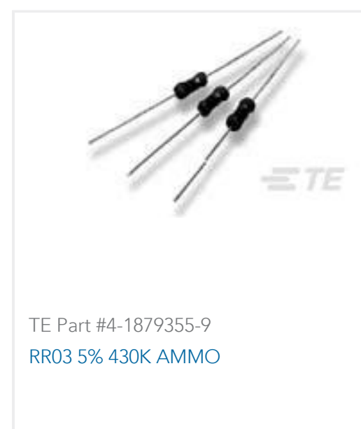
TE Part #4-1879355-9 RR03 5% 430K AMMO