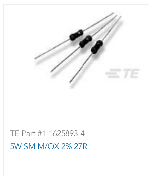
TE Part #1-1625893-4 5W SM M/OX 2% 27R