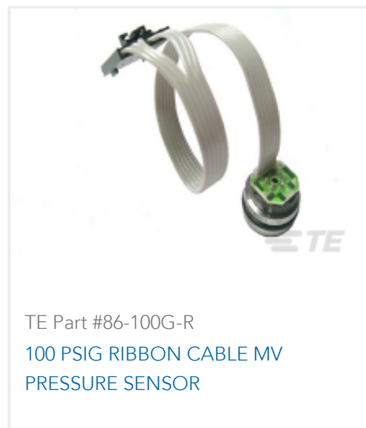
TE Part #86-100G-R 100 PSIG RIBBON CABLE MV PRESSURE SENSOR