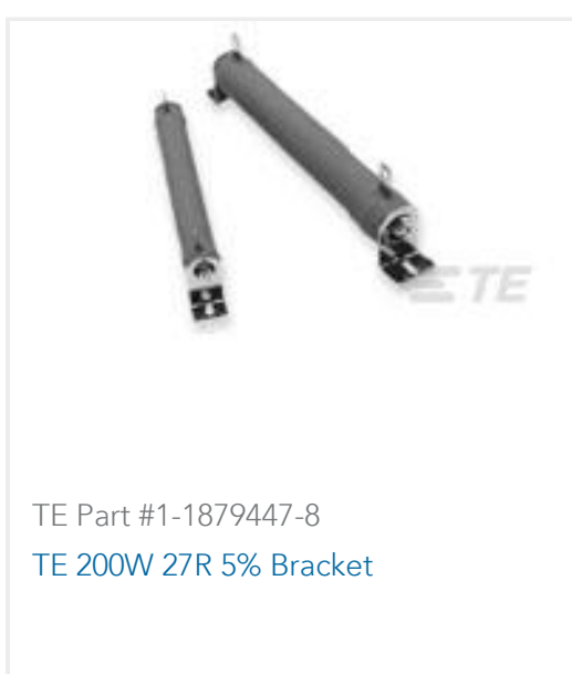
TE Part #1-1879447-8 TE 200W 27R 5% Bracket