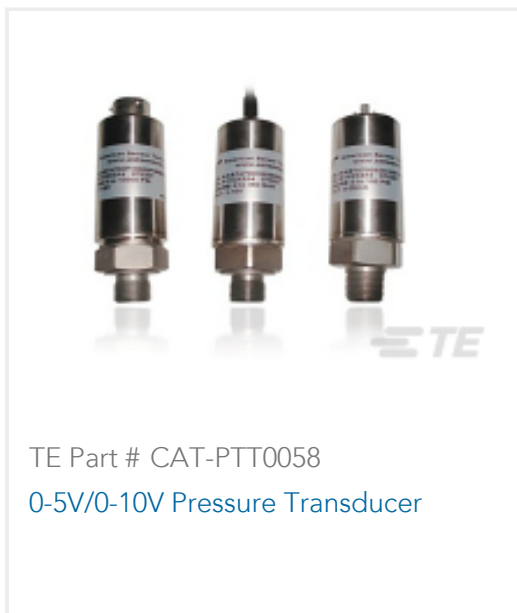
TE Part # CAT-PTT0058 0-5V/0-10V Pressure Transducer