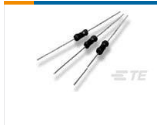
TE Part #1-1625893-4 5W SM M/OX 2% 27R