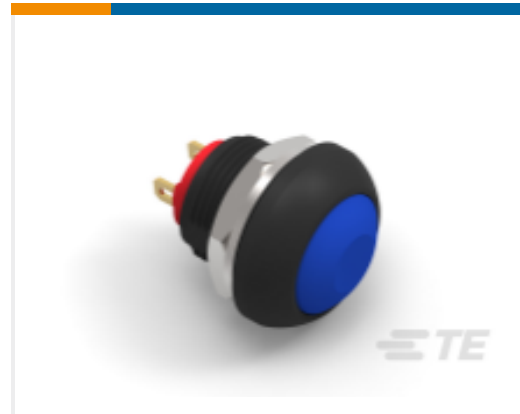
TE Part #2-2329383-5 PB ON/OFF FC BLU M1 TERM IP68