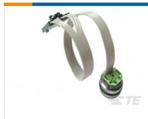
TE Part #86-100G-R 100 PSIG RIBBON CABLE MV PRESSURE SENSOR