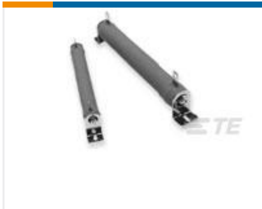
TE Part #1-1879447-8 TE 200W 27R 5% Bracket