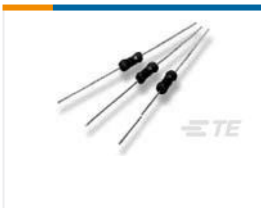
TE Part #4-1879355-9 RR03 5% 430K AMMO