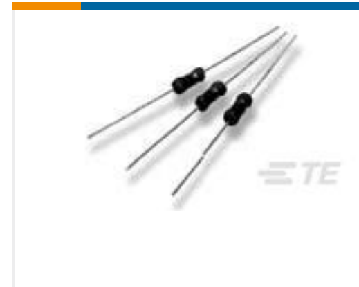
TE Part #7-1879350-5 RR01 5% 270R AMMO