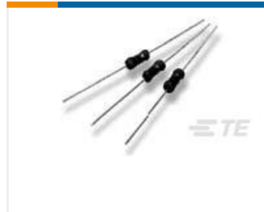
TE Part #1-1625893-4 5W SM M/OX 2% 27R