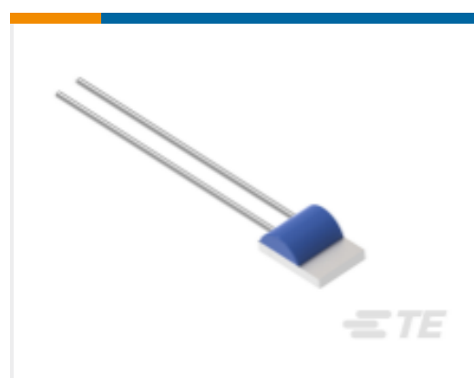
TE Part #NB-PTCO-163 Pt1000, 2.0x2.3, Class C, PTFC102C1A0