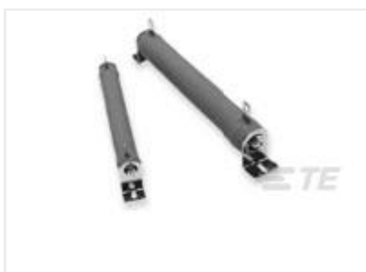
TE Part #1-1879447-8 TE 200W 27R 5% Bracket