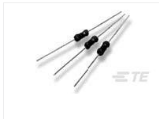
TE Part #7-1879350-5 RR01 5% 270R AMMO