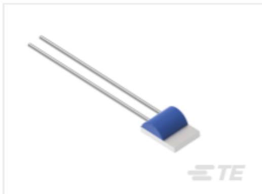
TE Part #NB-PTCO-159 Pt100, 2.0x2.3, Class C, PTFC101C1A0