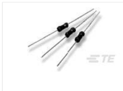
TE Part #1-1625893-4 5W SM M/OX 2% 27R