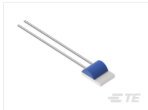
TE Part #NB-PTCO-163 Pt1000, 2.0x2.3, Class C, PTFC102C1A0