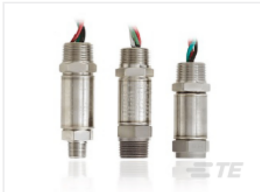
TE Part # CAT-PTT0053 Explosion Proof Pressure Transducer (Ex db IIC T5 Gb)