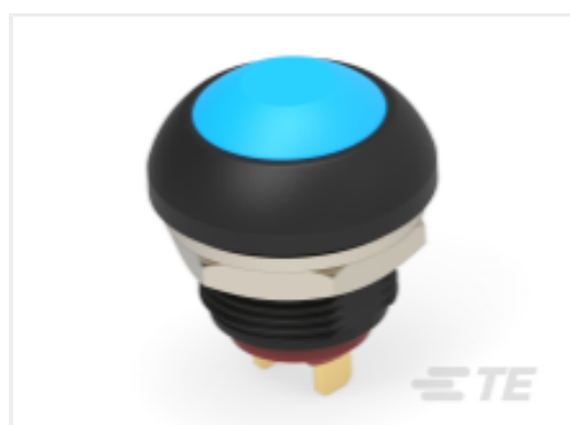
TE Part #2-2329383-5 PB ON/OFF FC BLU M1 TERM IP68