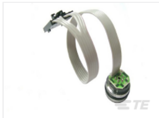
TE Part #86-100G-R 100 PSIG RIBBON CABLE MV PRESSURE SENSOR