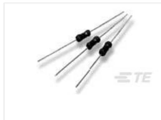
TE Part #4-1879355-9 RR03 5% 430K AMMO