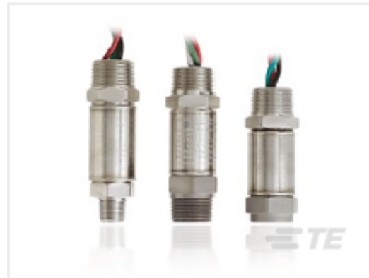
TE Part # CAT-PTT0053 Explosion Proof Pressure Transducer (Ex db IIC T5 Gb)