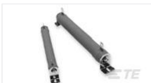
TE Part #1-1879447-8 TE 200W 27R 5% Bracket