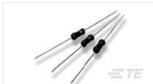
TE Part #1-1625893-4 5W SM M/OX 2% 27R