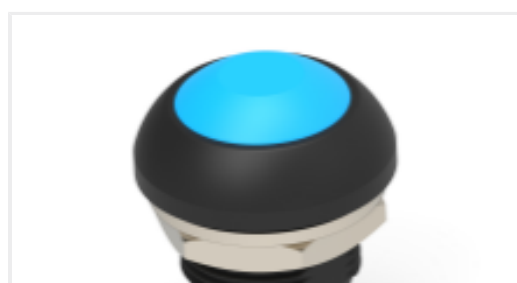
TE Part #2-2329383-5 PB ON/OFF FC BLU M1 TERM IP68