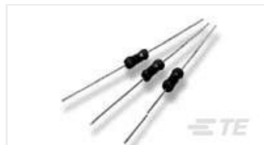
TE Part #4-1879355-9 RR03 5% 430K AMMO