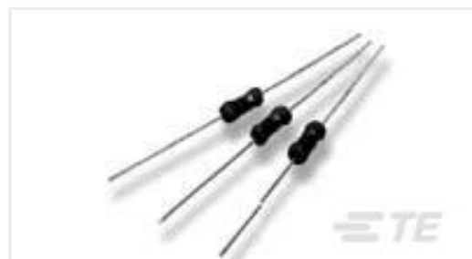
TE Part #7-1879350-5 RR01 5% 270R AMMO