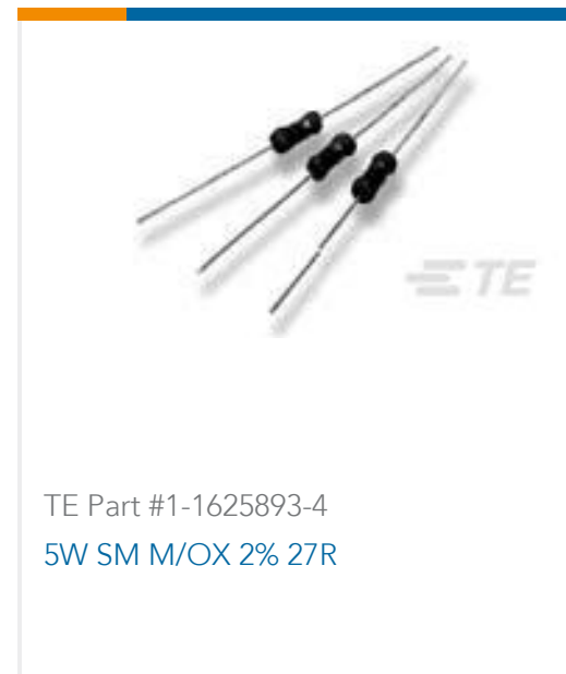
TE Part #1-1625893-4 5W SM M/OX 2% 27R