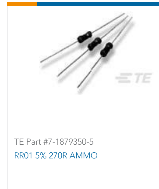
TE Part #7-1879350-5 RR01 5% 270R AMMO