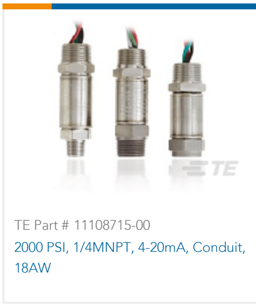
TE Part # 11108715-00 2000 PSI, 1/4MNPT, 4-20mA, Conduit, 18AW