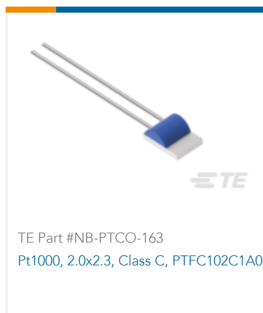
TE Part #NB-PTCO-163 Pt1000, 2.0x2.3, Class C, PTFC102C1A0