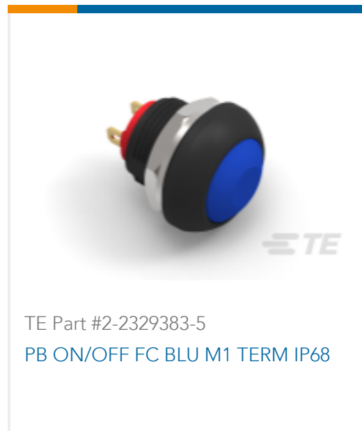
TE Part #2-2329383-5 PB ON/OFF FC BLU M1 TERM IP68