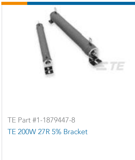
TE Part #1-1879447-8 TE 200W 27R 5% Bracket