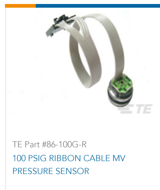
TE Part #86-100G-R 100 PSIG RIBBON CABLE MV PRESSURE SENSOR