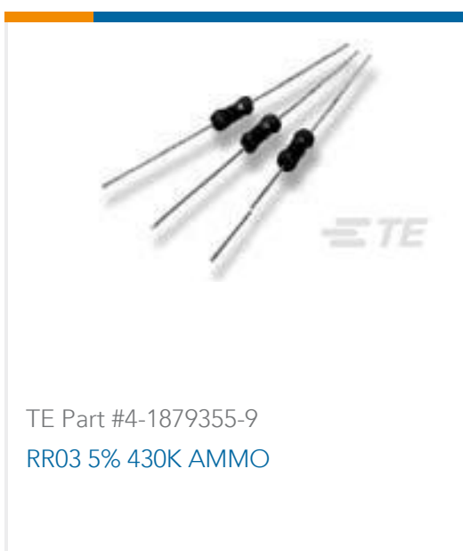
TE Part #4-1879355-9 RR03 5% 430K AMMO