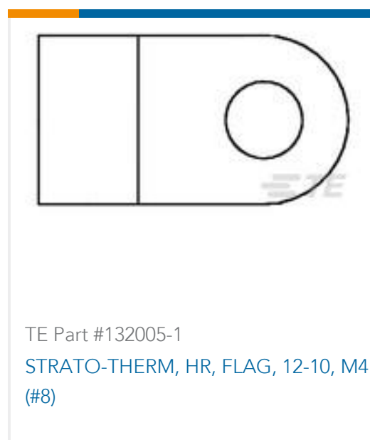
TE Part #132005-1 STRATO-THERM, HR, FLAG, 12-10, M4 (#8)