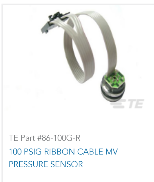
TE Part #86-100G-R 100 PSIG RIBBON CABLE MV PRESSURE SENSOR