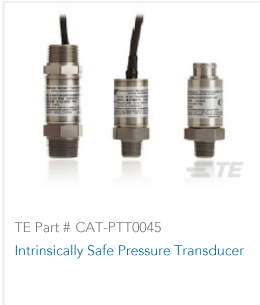
TE Part # CAT-PTT0045 Intrinsically Safe Pressure Transducer