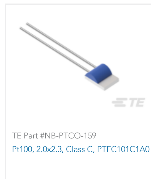
TE Part #NB-PTCO-159 Pt100, 2.0x2.3, Class C, PTFC101C1A0