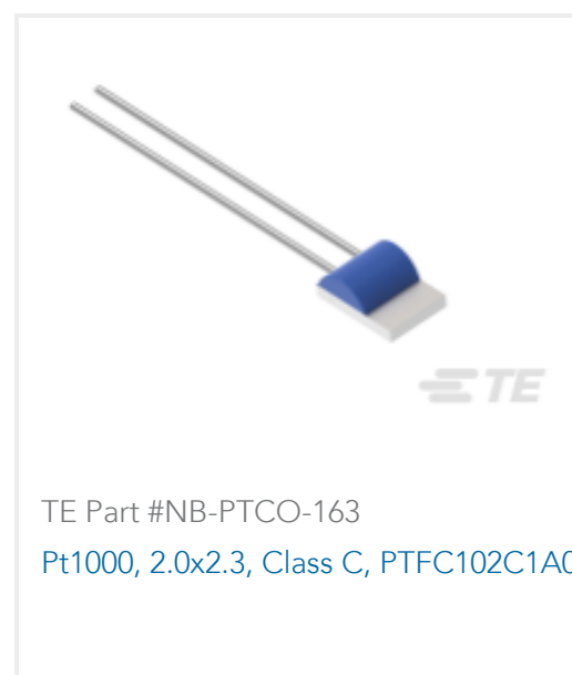
TE Part #NB-PTCO-163 Pt1000, 2.0x2.3, Class C, PTFC102C1A0