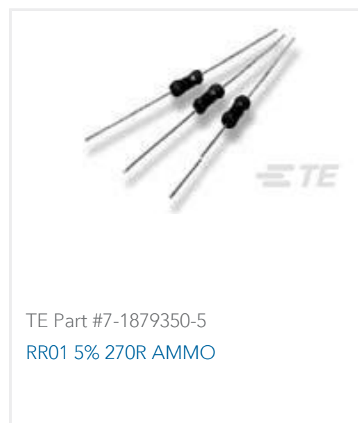
TE Part #7-1879350-5 RR01 5% 270R AMMO