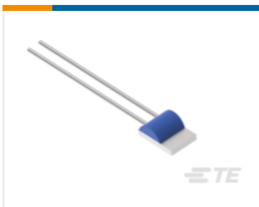
TE Part #NB-PTCO-159 Pt100, 2.0x2.3, Class C, PTFC101C1A0