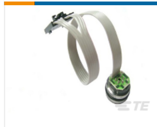
TE Part #86-100G-R 100 PSIG RIBBON CABLE MV PRESSURE SENSOR