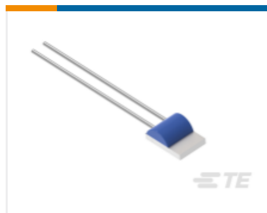
TE Part #NB-PTCO-163 Pt1000, 2.0x2.3, Class C, PTFC102C1A0