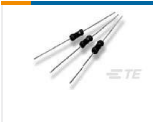
TE Part #4-1879355-9 RR03 5% 430K AMMO