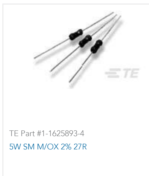
TE Part #1-1625893-4 5W SM M/OX 2% 27R