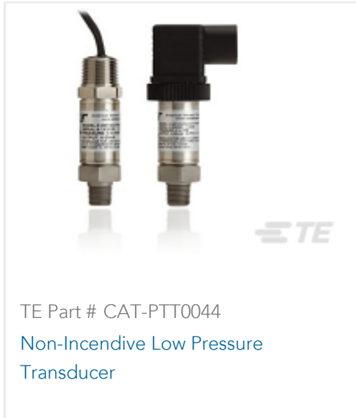
TE Part # CAT-PTT0044 Non-Incendive Low Pressure Transducer