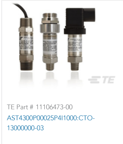
TE Part # 11106473-00 AST4300P00025P4H1000:CTO-13000000-03