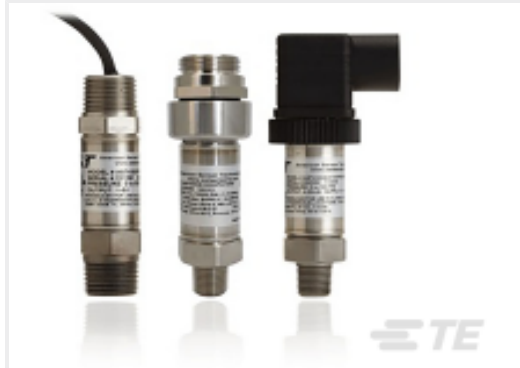
TE Part # 11106324-00 AST4300C00100B411000-SS:CTO-13000000-03