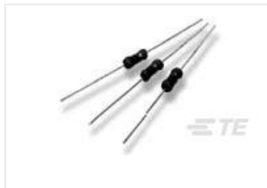
TE Part #1-1625893-4 5W SM M/OX 2% 27R (#8)