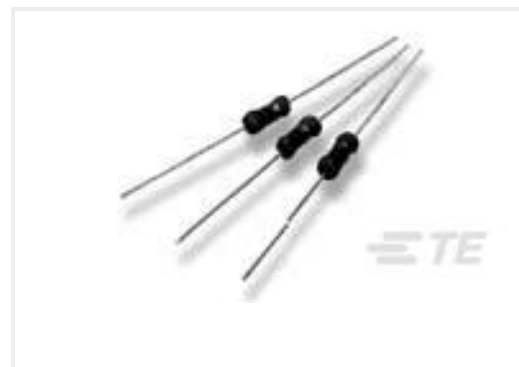
TE Part #4-1879355-9 RR03 5% 430K AMMO