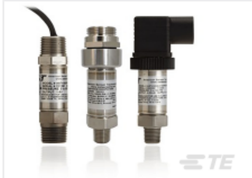
TE Part # 11106558-00 AST4300P00500P4P1000:CTO-13000000-03