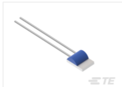
TE Part #NB-PTCO-159 Pt100, 2.0x2.3, Class C, PTFC101C1A0