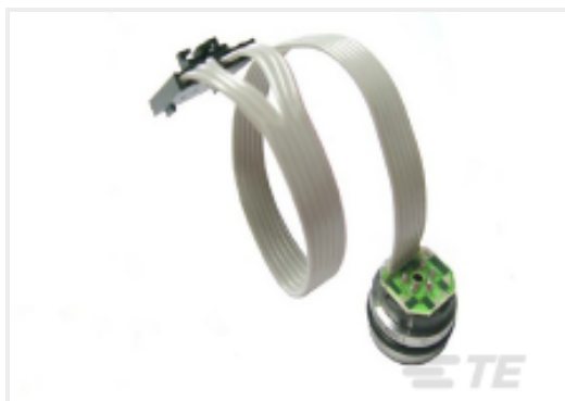
TE Part #86-100G-R 100 PSIG RIBBON CABLE MV PRESSURE SENSOR