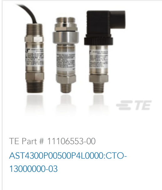
TE Part # 11106553-00 AST4300P00500P4L0000:CTO- 13000000-03