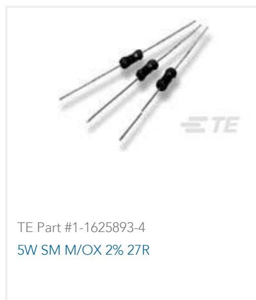
TE Part #1-1625893-4 5W SM M/OX 2% 27R (#8)