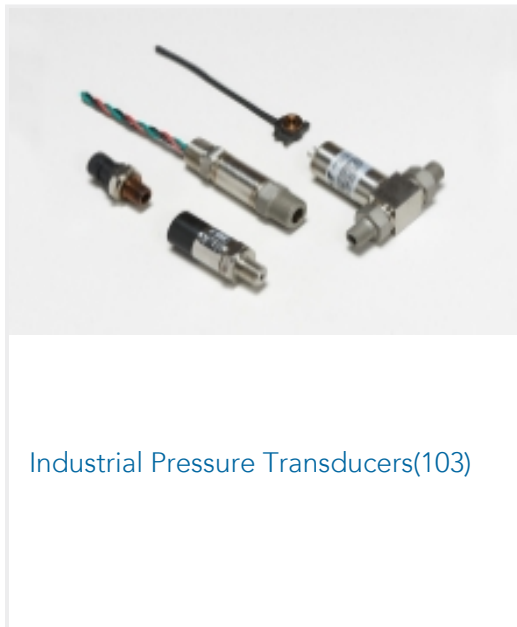
Industrial Pressure Transducers(103)