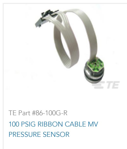
TE Part #86-100G-R 100 PSIG RIBBON CABLE MV PRESSURE SENSOR