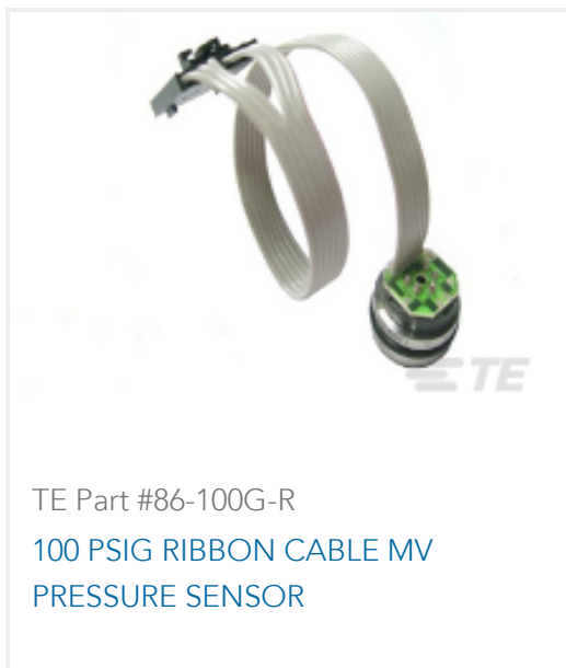
TE Part #86-100G-R 100 PSIG RIBBON CABLE MV PRESSURE SENSOR