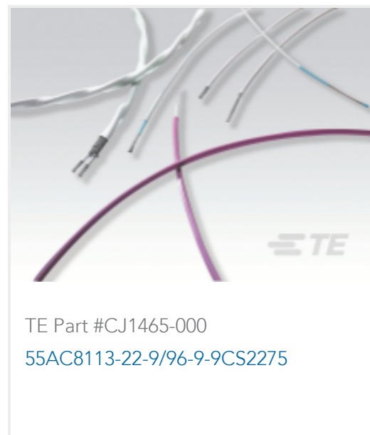
TE Part #CJ1465-000 55AC8113-22-9/96-9-9CS2275