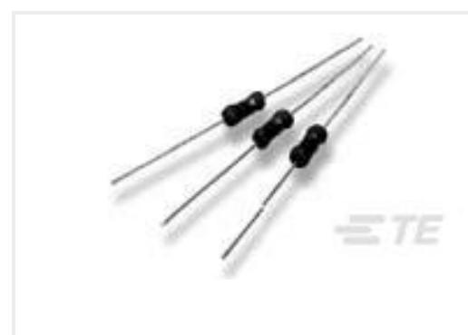
TE Part #7-1879350-5 RR01 5% 270R AMMO