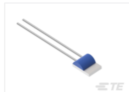
TE Part #NB-PTCO-159 Pt100, 2.0x2.3, Class C, PTFC101C1A0