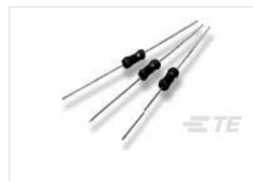
TE Part #4-1879355-9 RR03 5% 430K AMMO