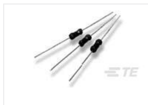
TE Part #1-1625893-4 5W SM M/OX 2% 27R (#8)