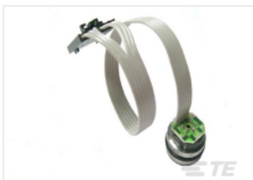
TE Part #86-100G-R 100 PSIG RIBBON CABLE MV PRESSURE SENSOR