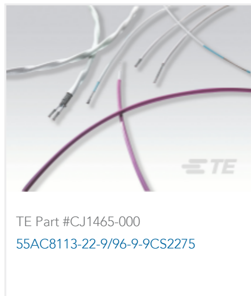
TE Part #CJ1465-000 55AC8113-22-9/96-9-9CS2275