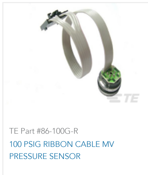
TE Part #86-100G-R 100 PSIG RIBBON CABLE MV PRESSURE SENSOR