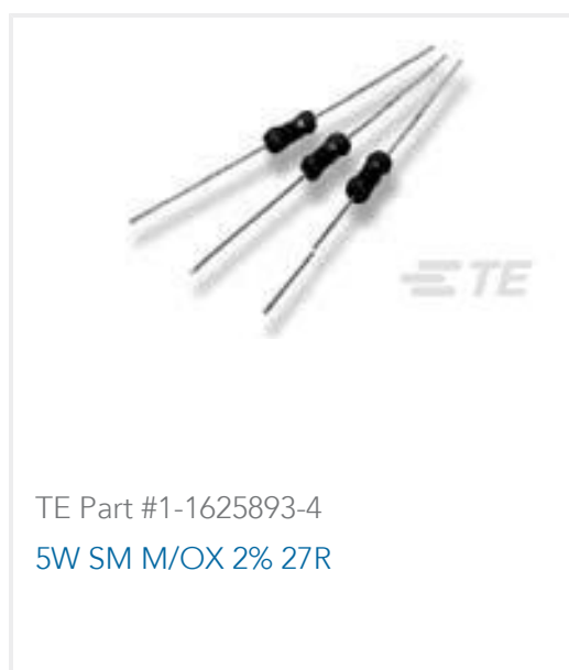
TE Part #1-1625893-4 5W SM M/OX 2% 27R (#8)