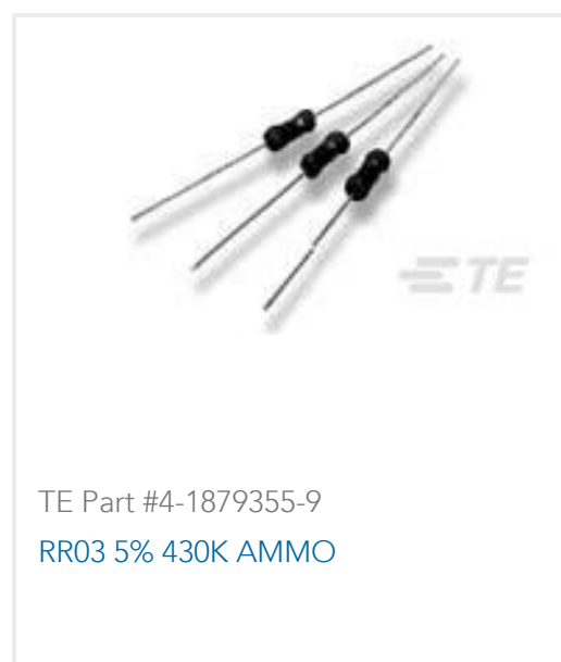
TE Part #4-1879355-9 RR03 5% 430K AMMO