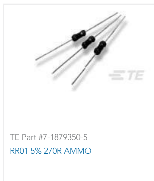
TE Part #7-1879350-5 RR01 5% 270R AMMO