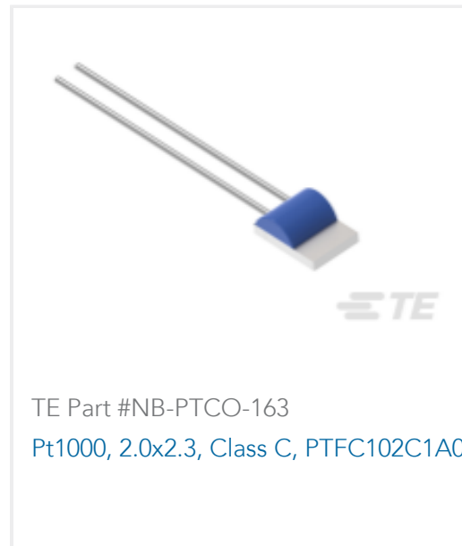
TE Part #NB-PTCO-163 Pt1000, 2.0x2.3, Class C, PTFC102C1A0