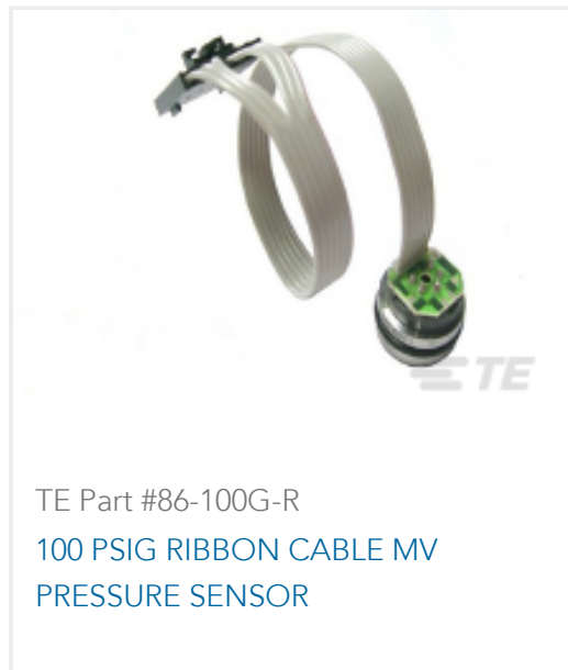
TE Part #86-100G-R 100 PSIG RIBBON CABLE MV PRESSURE SENSOR