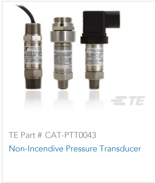
TE Part # CAT-PTT0043 Non-Incendive Pressure Transducer