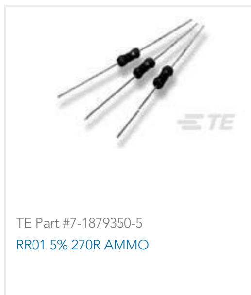
TE Part #7-1879350-5 RR01 5% 270R AMMO