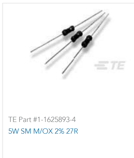
TE Part #1-1625893-4 5W SM M/OX 2% 27R