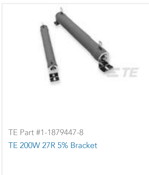
TE Part #1-1879447-8 TE 200W 27R 5% Bracket