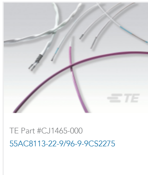
TE Part #CJ1465-000 55AC8113-22-9/96-9-9CS2275