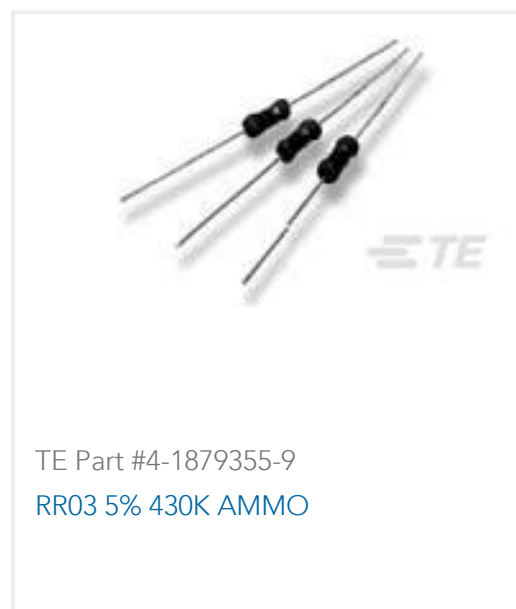
TE Part #4-1879355-9 RR03 5% 430K AMMO