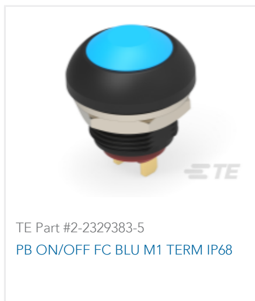
TE Part #2-2329383-5 PB ON/OFF FC BLU M1 TERM IP68