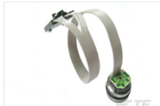
TE Part #86-100G-R 100 PSIG RIBBON CABLE MV PRESSURE SENSOR