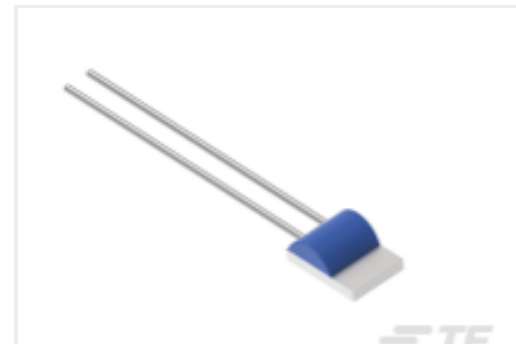
TE Part #NB-PTCO-163 Pt1000, 2.0x2.3, Class C, PTFC102C1A0