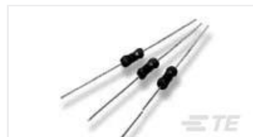
TE Part #4-1879355-9 RR03 5% 430K AMMO