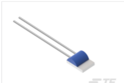
TE Part #NB-PTCO-159 Pt100, 2.0x2.3, Class C, PTFC101C1A0