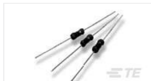
TE Part #1-1625893-4 5W SM M/OX 2% 27R (#8)