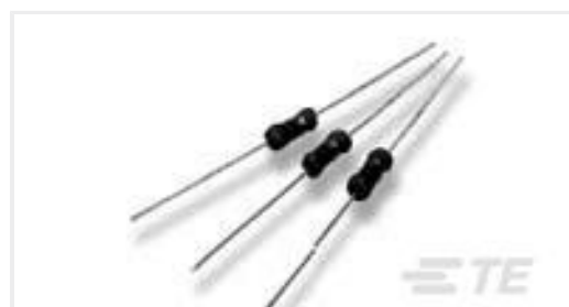
TE Part #7-1879350-5 RR01 5% 270R AMMO