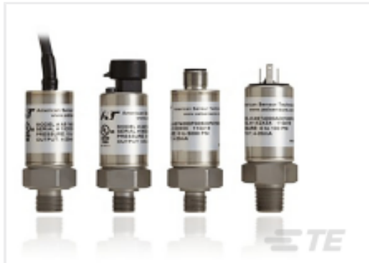
TE Part # CAT-PTT0040 4-20mA / Voltage Pressure Transducer