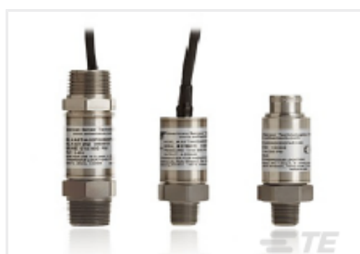
TE Part #11192436-00 5000 PSI, 1/2MNPT, 1-5V, 316L, 25 ft