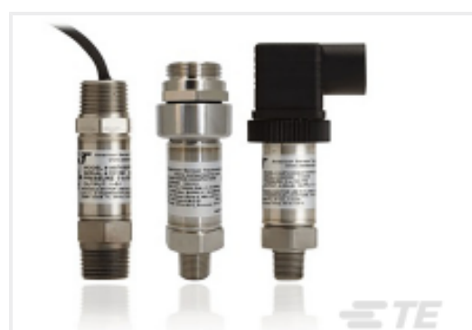
TE Part #11105837-00 300 PSI, 1/4MNPT, 4-20mA, Conduit, 4ft.,