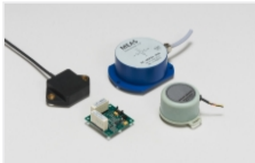
Tilt Sensors & Inclinometers(2)