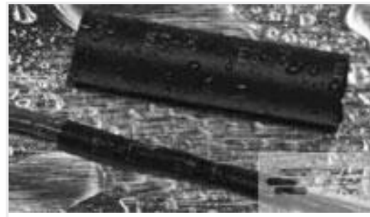
TE Part #121397P024 ES2000-NO.3-B8-0-STK