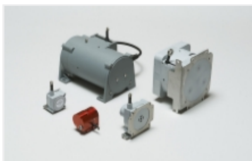
Cable Actuated Position Sensors(1024)