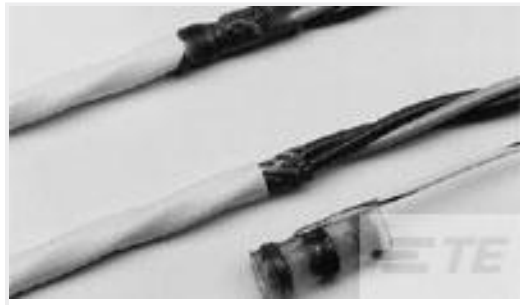
TE Part #694681-000 CWT-3807-W2