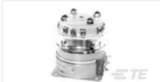
TE Part #1393139-2 MDR-131-1=MDR