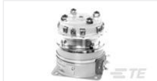
TE Part #1-1393139-5 MDR-163-1=MDR