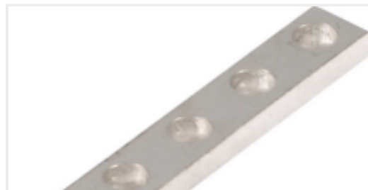
TE Part #1SNA167856R2100 BJS24-10