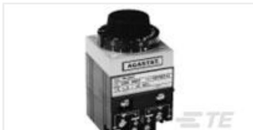
TE Part #3-1423157-7 7012CB=RLY,STD,ON,2P,480VAC,5