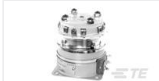
TE Part #1393139-4 MDR-134-1=MDR