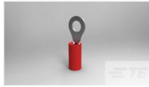
TE Part #320551 PIDG R 22-16 COMM 22-18 MIL 8