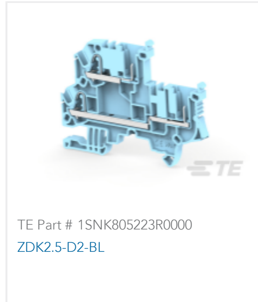
TE Part # 1SNK805223R0000 ZDK2.5-D2-BL