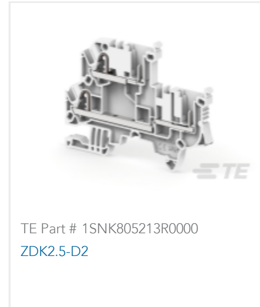
TE Part # 1SNK805213R0000 ZDK2.5-D2