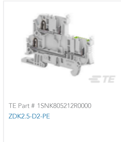
TE Part # 1SNK805212R0000 ZDK2.5-D2-PE