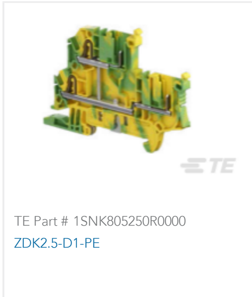
TE Part # 1SNK805250R0000 ZDK2.5-D1-PE