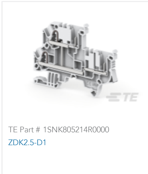
TE Part # 1SNK805214R0000 ZDK2.5-D1