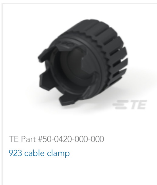
TE Part #50-0420-000-000 923 cable clamp