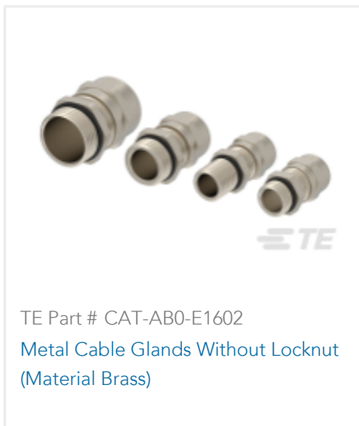
TE Part # CAT-AB0-E1602 Metal Cable Glands Without Locknut (Material Brass)