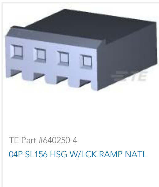
TE Part #640250-4 04P SL156 HSG W/LCK RAMP NATL