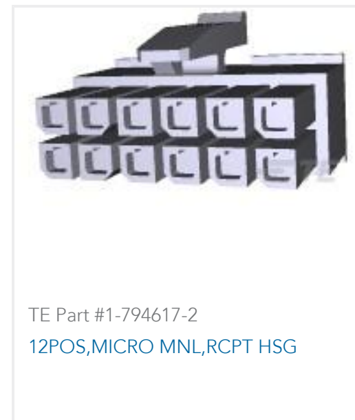
TE Part #1-794617-2 12POS,MICRO MNL,RCPT HSG