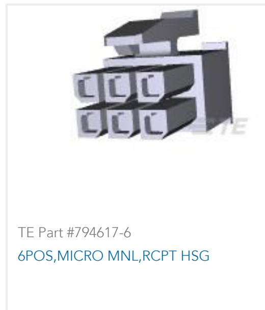
TE Part #794617-6 6POS,MICRO MNL,RCPT HSG