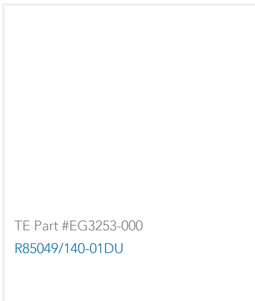
TE Part #EG3253-000 R85049/140-01DU