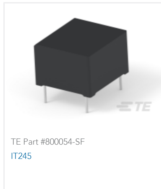
TE Part #800054-SF IT245