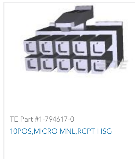
TE Part #1-794617-0 10POS,MICRO MNL,RCPT HSG