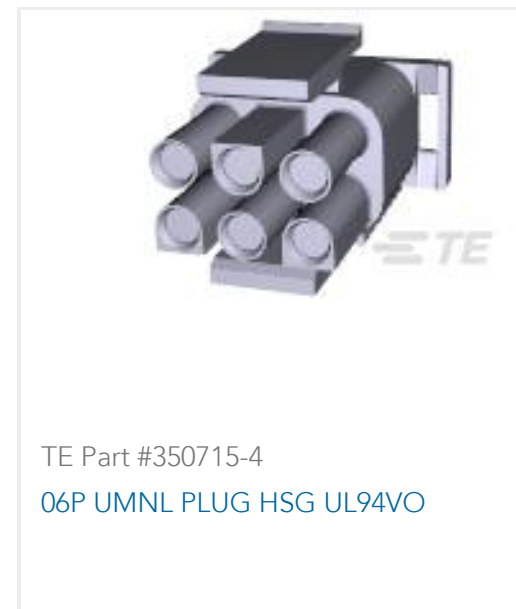
TE Part #350715-4 06P UMNL PLUG HSG UL94VO