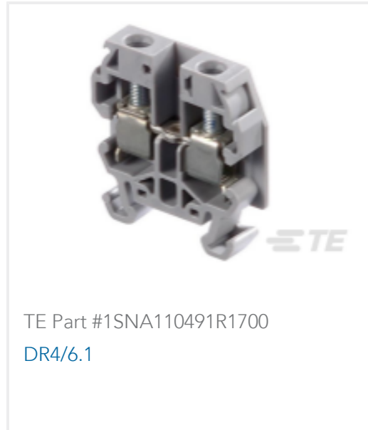
TE Part #1SNA110491R1700 DR4/6.1