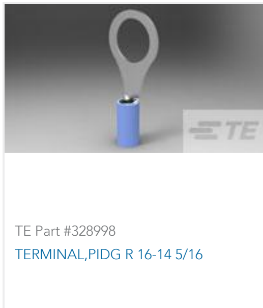
TE Part #328998 TERMINAL, PIDG R 16-14 5/16