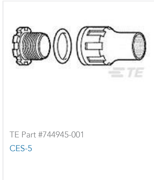
TE Part #744945-001 CES-5