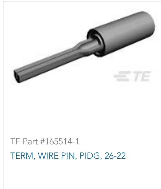
TE Part #165514-1 TERM, WIRE PIN, PIDG, 26-22