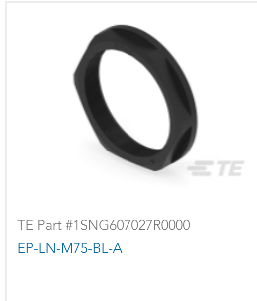
TE Part #1SNG607027R0000 EP-LN-M75-BL-A