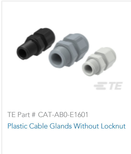
TE Part # CAT-AB0-E1601 Plastic Cable Glands Without Locknut