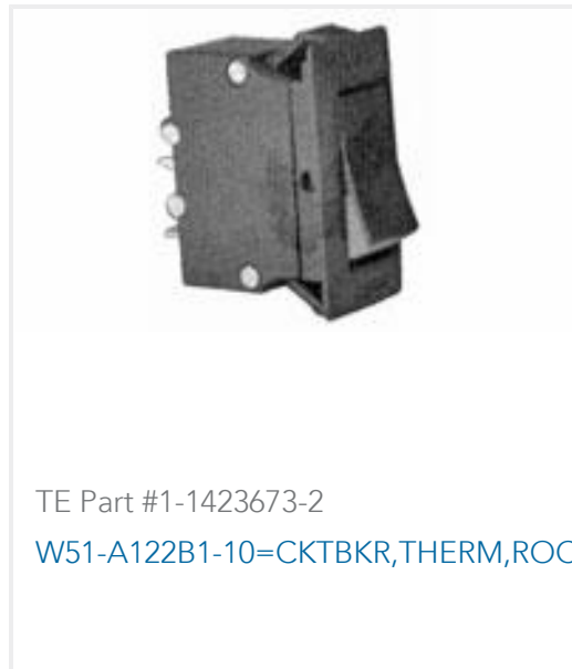
TE Part #1-1423673-2 W51-A122B1-10=CKTBKR, THERM, ROC