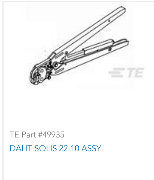
TE Part #49935 DAHT SOLIS 22-10 ASSY