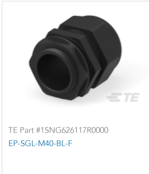
TE Part #1SNG626117R0000 EP-SGL-M40-BL-F