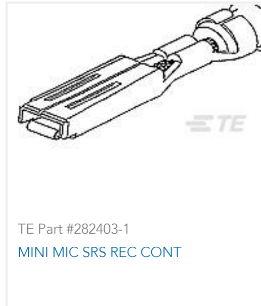
TE Part #282403-1 MINI MIC SRS REC CONT