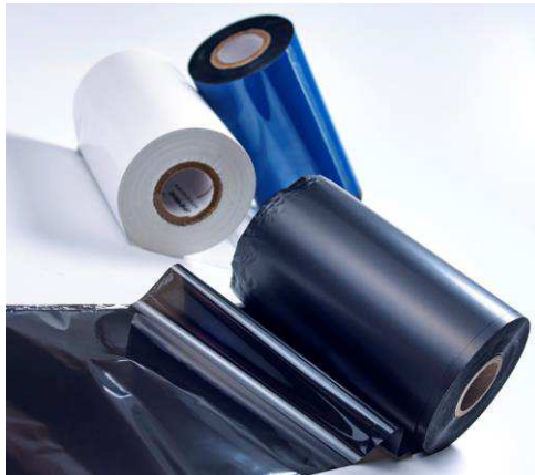
Thermal Transfer ribbons

Caution: It is recommended to store ribbon in a cool, dark place. Avoid storing ribbon in a location that would expose it to high temperature, high humidity, or direct sunlight. Print performance cannot be guaranteed if shelf life and storage conditions are not adhered to.