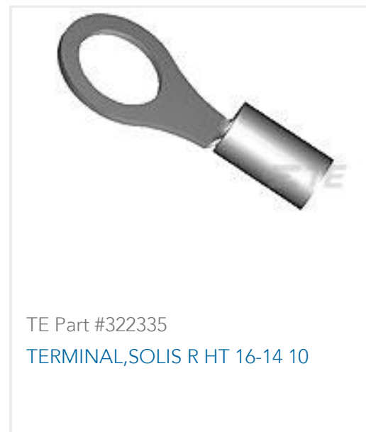
TE Part #322335 TERMINAL,SOLIS R HT 16-14 10