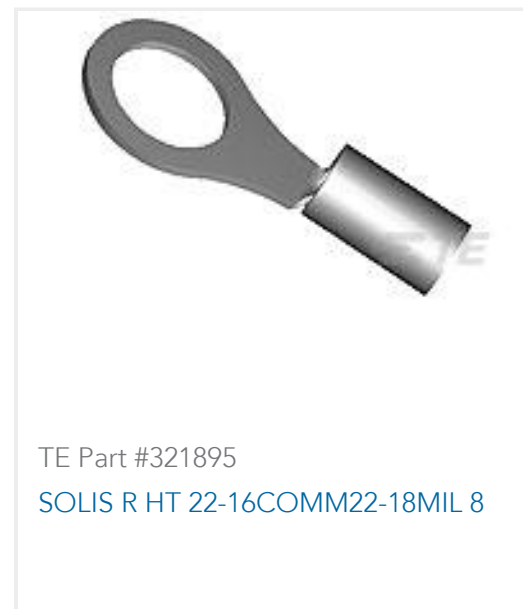
TE Part #321895 SOLIS R HT 22-16COMM22-18MIL 8