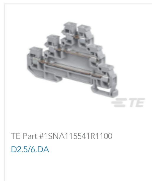
TE Part #1SNA115541R1100 D2.5/6.DA