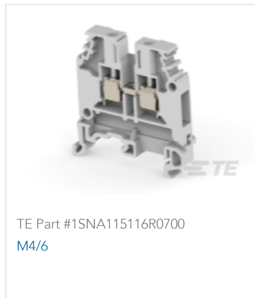
TE Part #1SNA115116R0700 M4/6