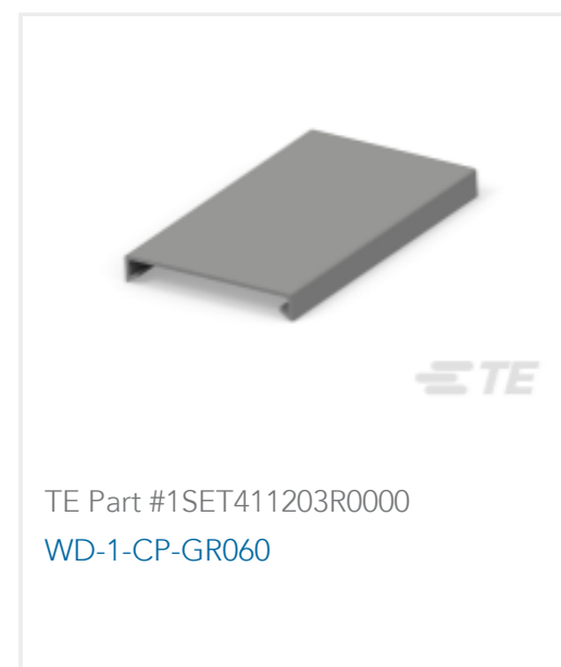
TE Part #1SET411203R0000 WD-1-CP-GR060