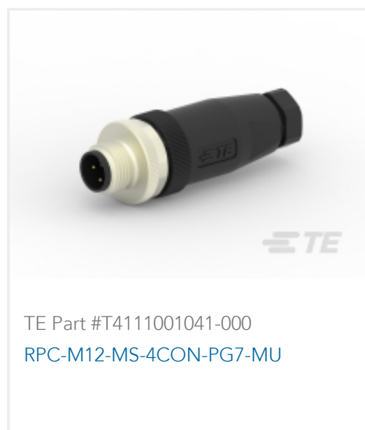
TE Part #T4111001041-000 RPC-M12-MS-4CON-PG7-MU