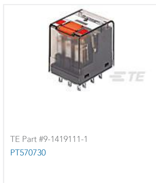
TE Part #9-1419111-1 PT570730