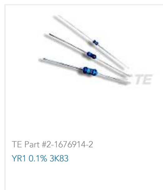
TE Part #2-1676914-2 YR1 0.1% 3K83