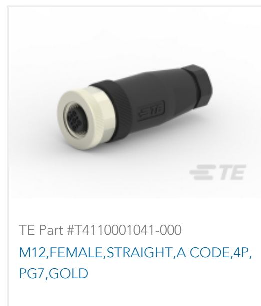
TE Part #T4110001041-000 M12,FEMALE,STRAIGHT,A CODE,4P, PG7,GOLD