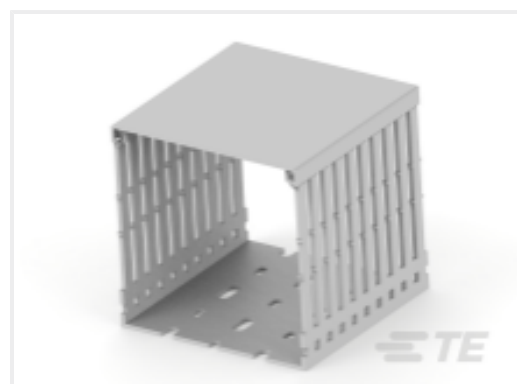
TE Part # CAT-Z62-W1-DP PVC Wiring Duct: 2 meters, Gray Color, Flame-Retardant