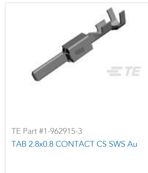
TE Part #1-962915-3 TAB 2.8x0.8 CONTACT CS SWS Au