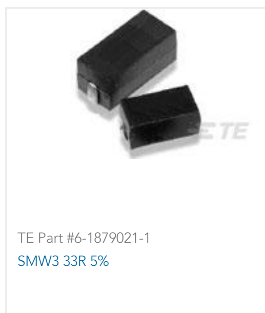
TE Part #6-1879021-1 SMW3 33R 5%