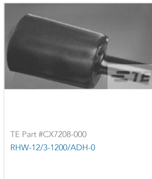
TE Part #CX7208-000 RHW-12/3-1200/ADH-0