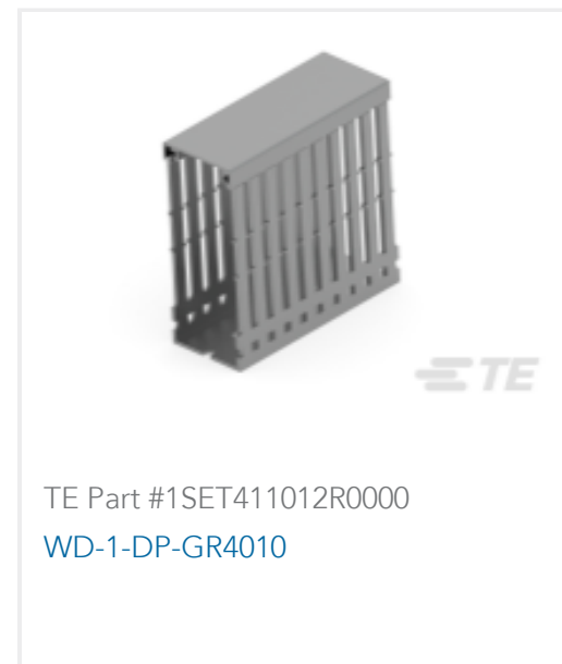
TE Part #1SET411012R0000 WD-1-DP-GR4010