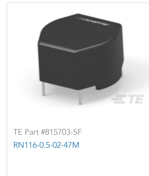
TE Part #815703-SF RN116-0.5-02-47M