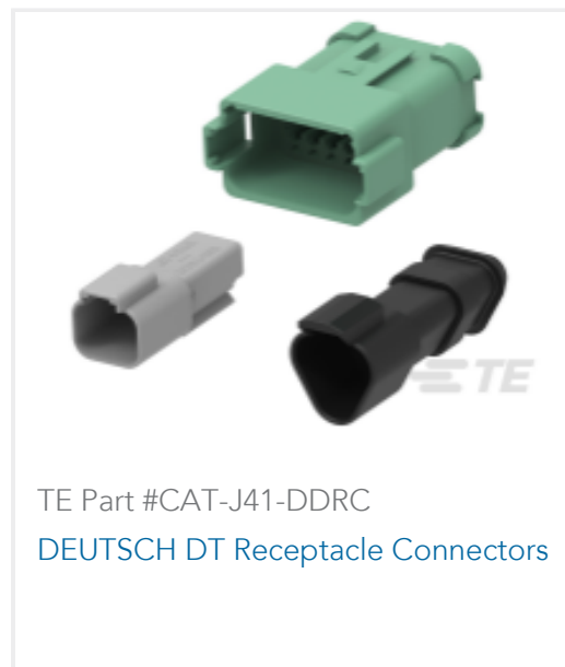
TE Part #CAT-J41-DDRC DEUTSCH DT Receptacle Connectors