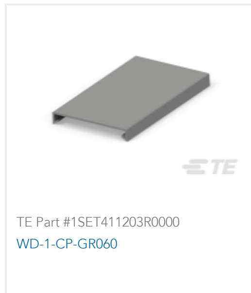
TE Part #1SET411203R0000 WD-1-CP-GR060