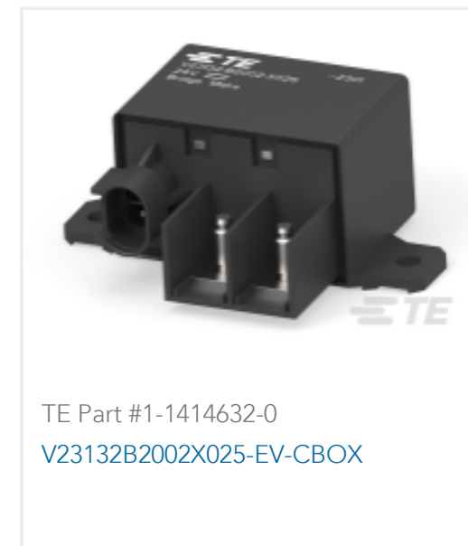
TE Part #1-1414632-0 V23132B2002X025-EV-CBOX