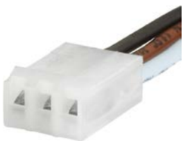
Wire Harness Wire harness for SCHURTER products