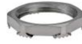
NPB Locking Nut