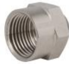
Adapter PG 29 to 1" NPT