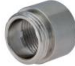
Enlarger PG 29 to PG 36