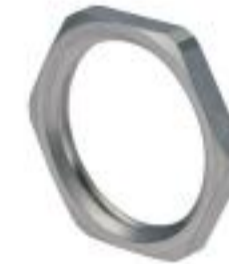
NPB Locking Nut